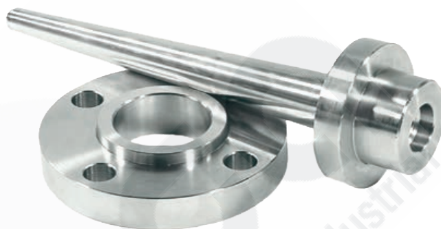
Thermowell model TW31 (lap flange, optional)